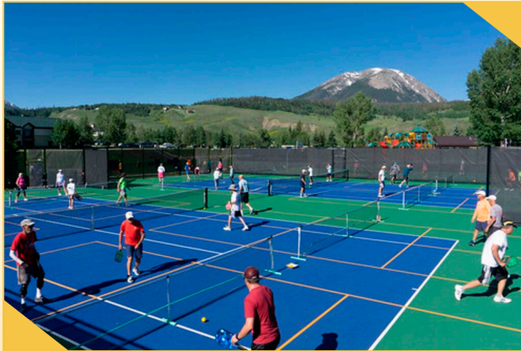
An example of tennis courts striped for picklball

Please consider voicing your opinion. I think we can win this battle if we have power in numbers!