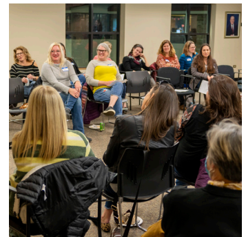
Serving Tennis Women event Feb 10